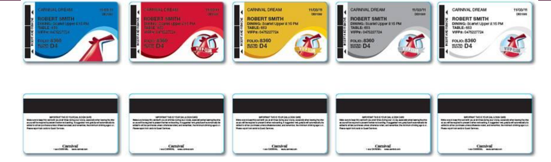
What's it for